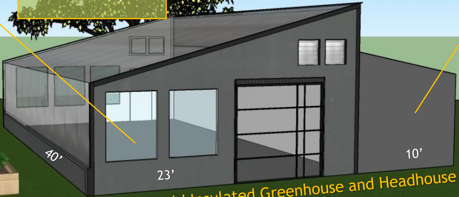
Ceres HighYield Insulated Greenhouse and Headhouse

400 ft. 2 of Propagation & Prep Space, Seed to Sell!